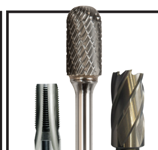
Gas & Welding